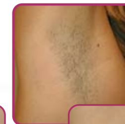
Hair Removal Before and 9 months after 3 treatments.