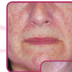
Photorejuvenation Before, and after 3 treatments.