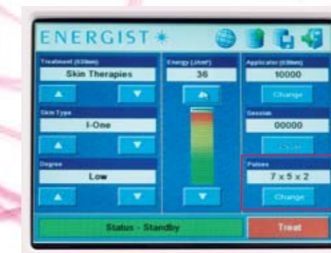
Intuitive Windows XP driven touch screen