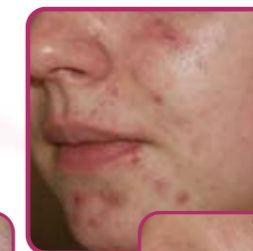
Active Acne Before, and after 3 treatments.